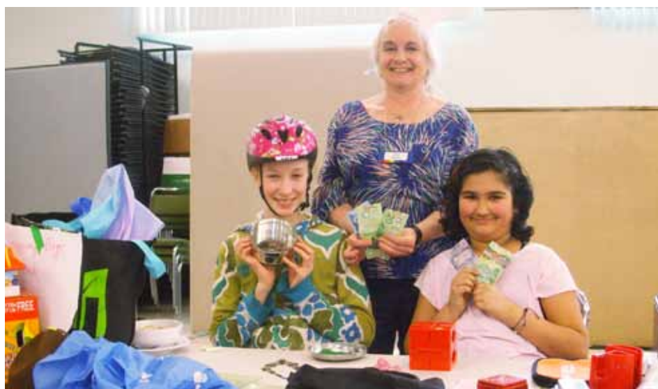
Rummage sale raises $240 to buy toys for our Syrian children.