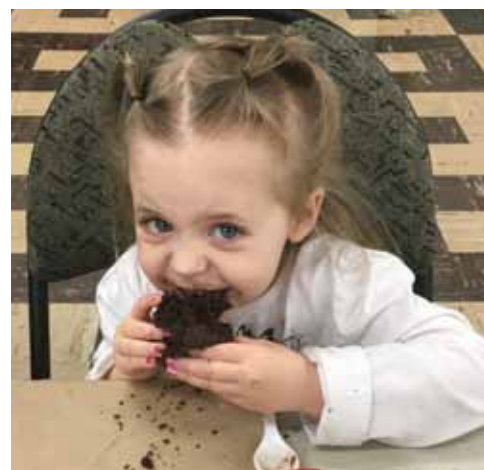
Making and eating treats to celebrate the first day of spring.