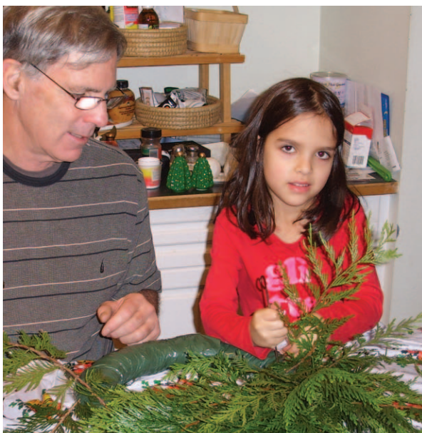
Potluck lunch and making the advent wreath in November.