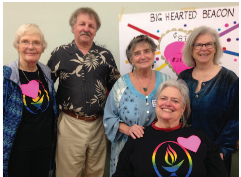
Visit from Nelson Unitarian Spiritual Center members during the pledge drive in October.