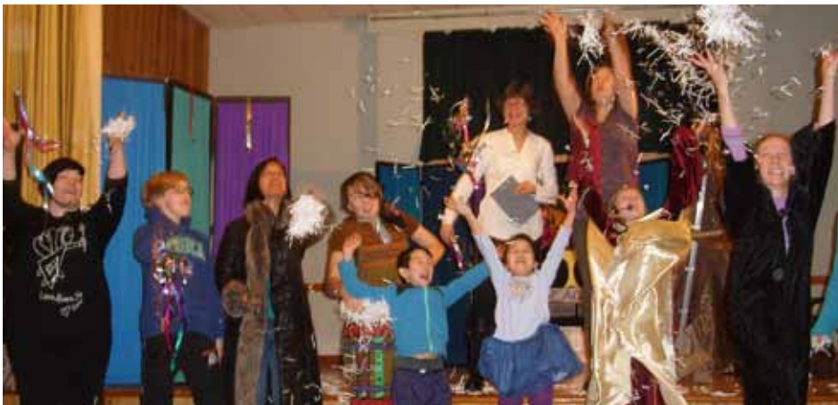
A Common Light was performed by Religious Exploration students and Beacon members in December.