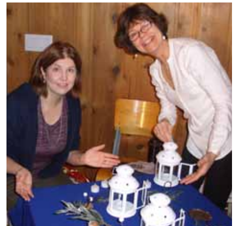
A Common Light was performed by Religious Exploration students and Beacon members in December.