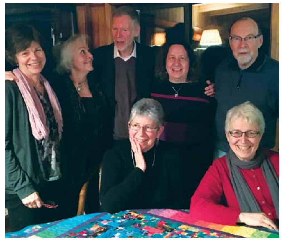
April 1st Circle dinner.