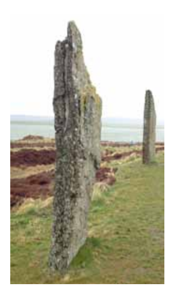
Stones at the Ring of Brodgar