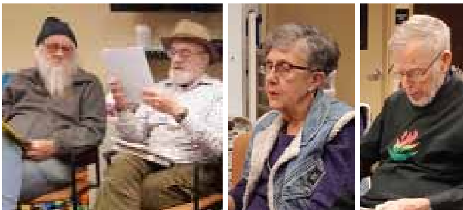
Here are some images from Humanist meetings before Covid.