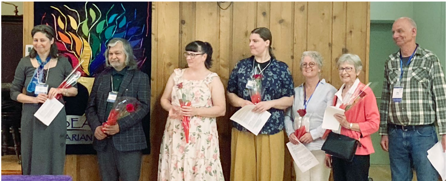
Beacon was thrilled to welcome eight new members on June 15, 2025 (with one joining in on Zoom).