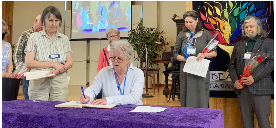
Each new member signed the Beacon membership book.